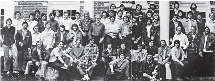
In this picture: Sigma Nu brothers in 1974.

We love coming across great old pictures from our chapter's history, and need your help to build up our archives on our new web site! Please share the best pictures from your era with us. You can upload them at www.uncsigmanu.com , or email them to our editors at content@affinityconnection.com .